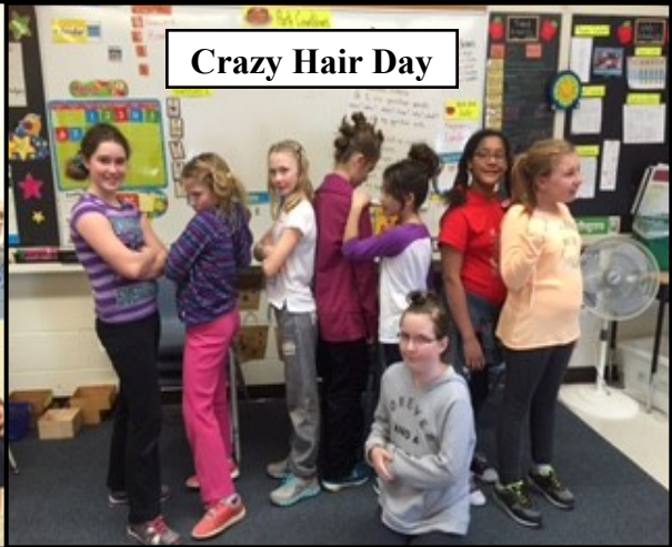
Crazy Hair Day